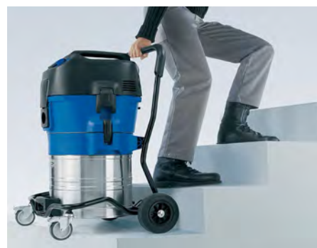
With a comfortable, integrated handle, it's easy to take the Attix 19 wherever the you work.