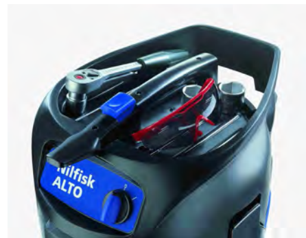
Improved accessory storage and tool deposit.