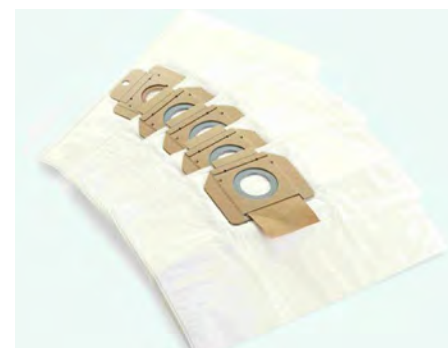
Fleece bags available for easy clean-up of debris.