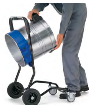
Tilt the container to empty, or simply lift it out of the frame to dispense of its contents.