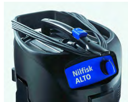
Sturdy grip for easy transport and cable storage.